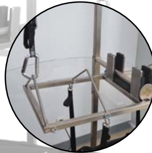
Adjustable sling suspension system