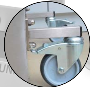
Wheel mounted, easy to transport