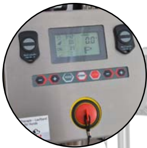
Easy to use and operate

An ideal alternative to the underwater treadmill. Versatile and effective, it is easy to install and use. An integrated laser makes the therapy more efficacious.