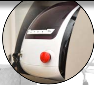
Integrated laser therapy for accelerated healing