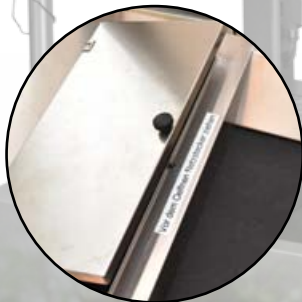
Conveniently located service door for cleaning and maintenance