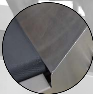
Angled side walls for injury prevention