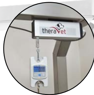
Quiet, powerful electric winch with an integrated scale